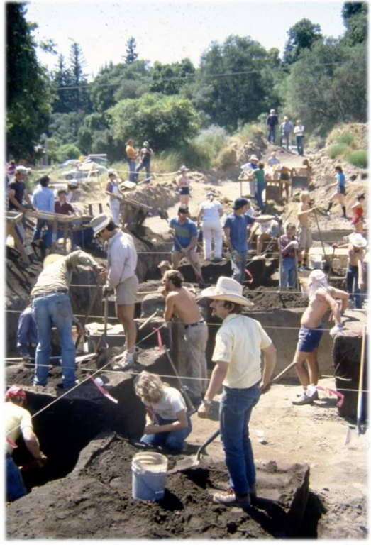
Scotts Valley 1983: 100+ person excavation crew.

Due in great part to the high visibility of the archaeological activities in the 1980s and the awareness of the archaeological interest from the local community, Cabrillo College created a full credit, vocational certificate program in the early 1990s, the Cabrillo College Archaeological Technology Program (CCATP) . SCAS members were among the first to go through the courses and receive vocational certificates. SCAS folks then raised funds for scholarships for other students.