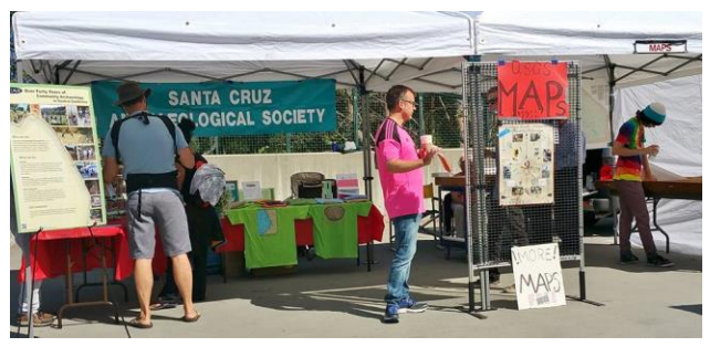
SCAS outreach at the Cabrillo Farmers Market - 6/25/16

The Society provides what has to be one of the longest continuous archaeological lecture series in the State. These free events, held on the second Thursday of the month, have featured archaeologists from across California and the U.S., some of who have been members of SCAS, and local archaeological graduate students. The Society has published a newsletter, the SCAN, since 1972. They continue public outreach and education including participation in California's state-wide Archaeology Month, and in local cultural and historical events.