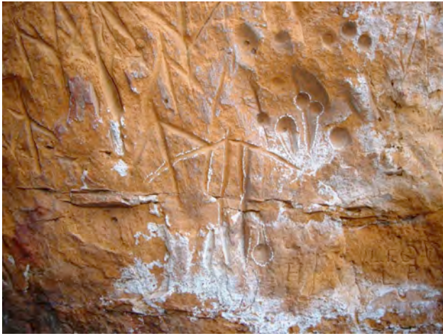
Large panel at the Lone Rock site featuring several motifs.