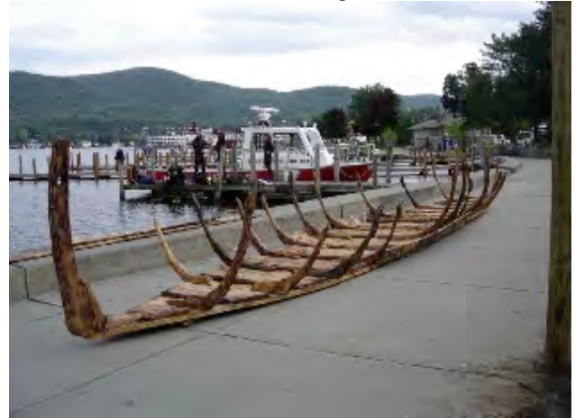
A 30 ft. long full-size replica 1758 bateau "wreck" lies on a walkway just before it was sunk into the shallows of Lake George on June 20. (credit: Bob Benway/Bateaux Below).

The bateaux were sunk in 15-40 ft. of water, an unusual eighteenth-century military strategy to protect the British vessels from French raiders over the winter of 1758-1759 when British forces retired from the lake area. Many of the submerged warships were retrieved by the British in 1759, possibly as many as 75-80%, and were then used in the 1759 campaign. For the past 21 years, Bateaux Below underwater archaeologists have been studying "The Sunken Fleet of 1758" and they have located over 40 sunken bateaux in the 32-mile-long lake.