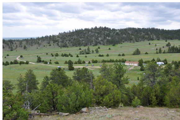
Figure 2. Hell Gap site, camp area for excavation personnel and visitors.